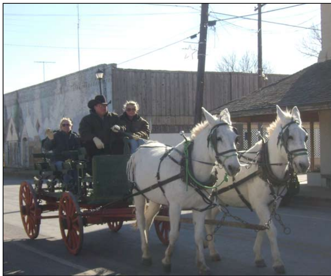
White mules pull a float in the Moran Christmas parade held Sunday, Dec. 21