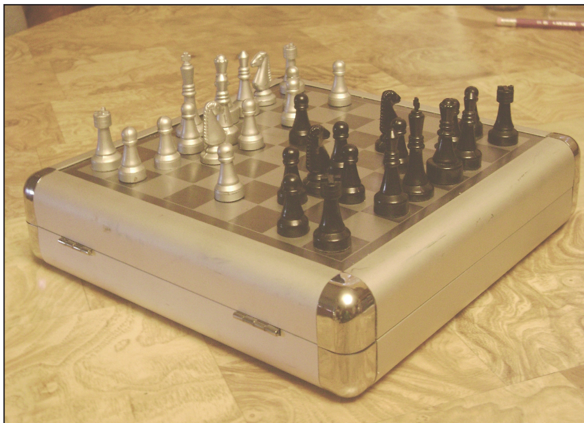
Anyone up for a game of chess?